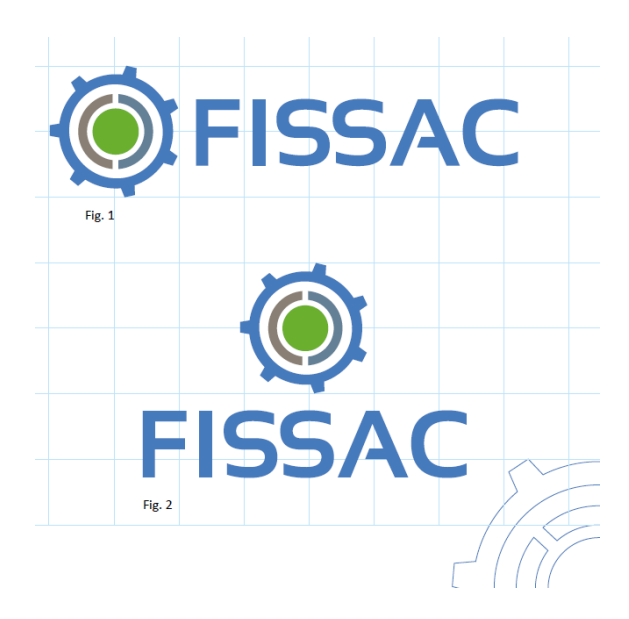
Figure 2- FISSAC logo

The FISSAC logo is unique and simple. It represents the essential ideas and message of the project i.e. the industrial wheel element with the steps of circular economy. Inside there are two layers of circles. The first two colours represent the two main actors of the project (industry and stakeholders) while the green colour represents that sustainability is moving the wheel.