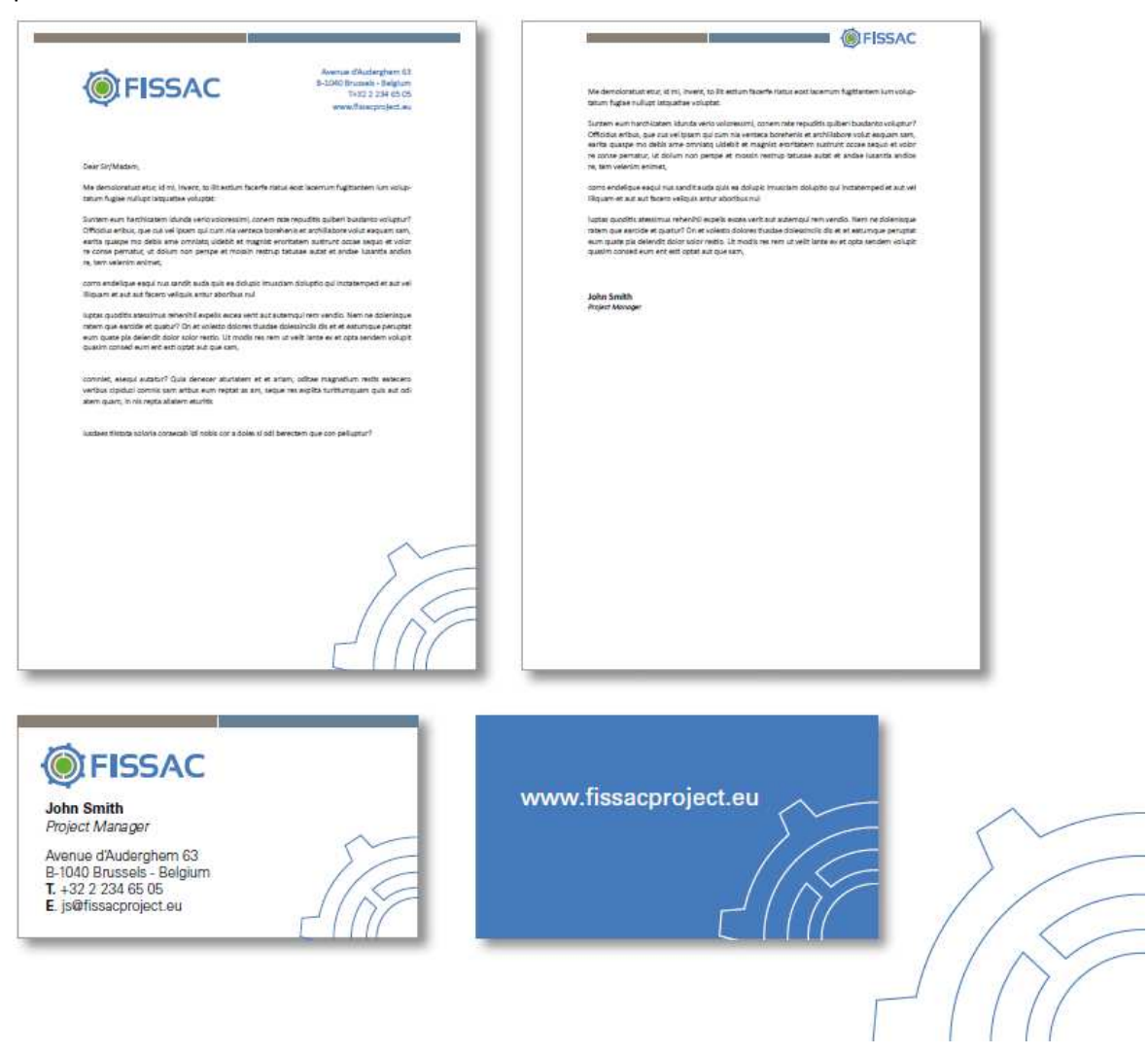
Figure 4- Examples of brand elements