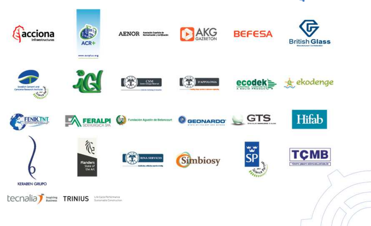
Figure 1 - FISSAC partners

All project partners have experience in European funded projects and in using communication tools, disseminating information, and raising awareness amongst complex and different target audience.